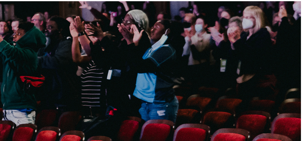
CIFF46 Volunteers and RedCoats