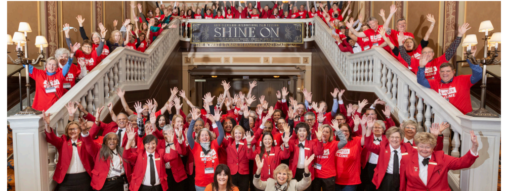
CIFF46 Volunteers and RedCoats