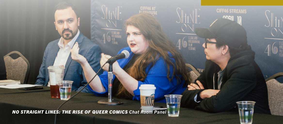
NO STRAIGHT LINES: THE RISE OF QUEER COMICS Chat Room Panel