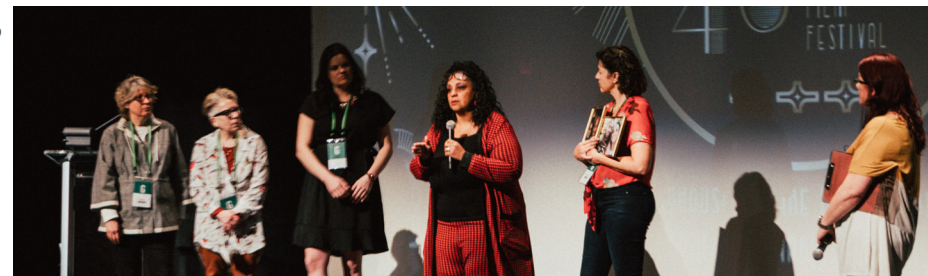
INHOSPITABLE Q&A in Allen Theatre